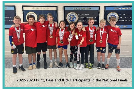
2022-2023 Punt, Pass and Kick Participants in the National Finals