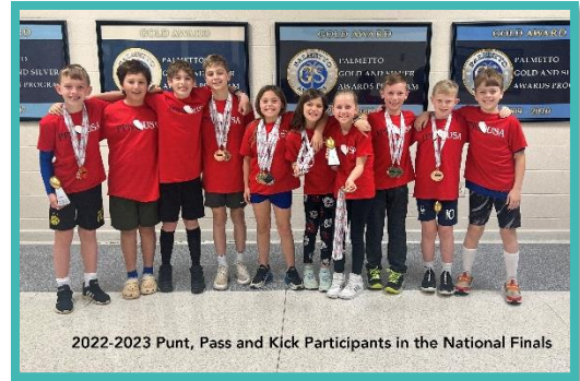
2022-2023 Punt, Pass and Kick Participants in the National Finals